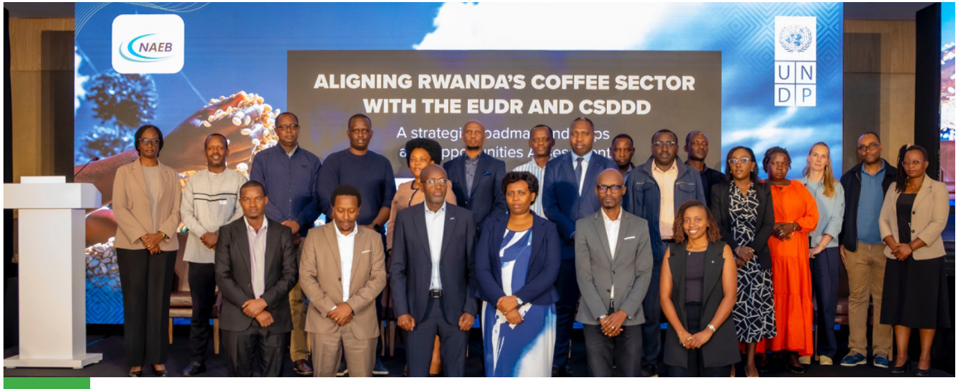
Rwanda coffee sector stakeholders pose for a group photo during the EUDR & CSDDD roadmap lunch.

Kigali, 19th February 2026; NAEB with partners officially launched the Roadmap for Aligning Rwanda's Coffee Sector with the EU Deforestation Regulation (EUDR) and the Corporate Sustainability Due Diligence Directive (CSDDD).