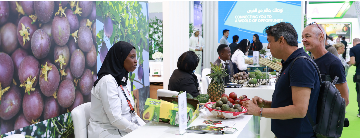
Rwanda Fresh Products Exporters engaging with buyers at the Gulfood Exhibition in Dubai.

From 26 to 30 January 2026, the National Agricultural Export Development Board (NAEB) along with Rwandan producers seeking to expand their products to international markets, participated in the annual Gulfood Exhibition,