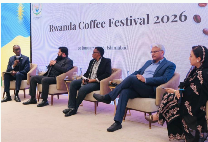
NAEB's CEO highlighting the uniqueness of Rwanda coffee to Pakistani investors during the festival.

Rwanda is leveraging its strong foothold in Pakistan's tea market to introduce its premium coffee, aiming to penetrate a new niche among the South Asian nation's growing community of coffee enthusiasts.