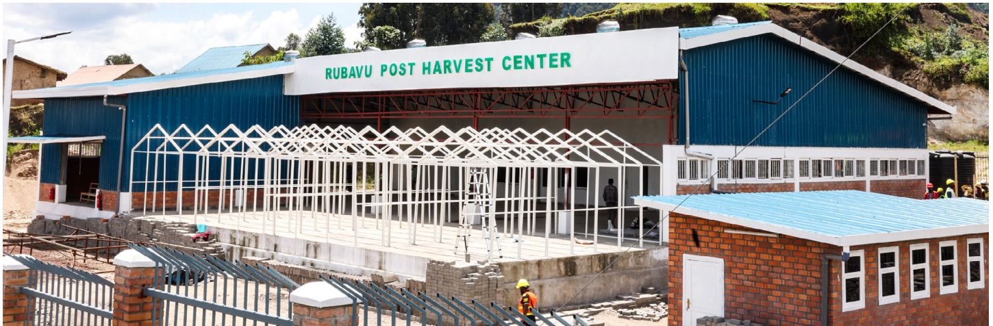
Rubavu Post-Harvest Center, dedicated to onion curing is nearly completion

Through the Smart Food Value Chain Management Project, NAEB is establishing one National and four Local Post-Harvest Centers dedicated to onions and chili. These facilities are strategically located in Kigali City, Rubavu, Rulindo, Bugesera, and Nyagatare Districts to enhance post-harvest handling capacity across key production zones.